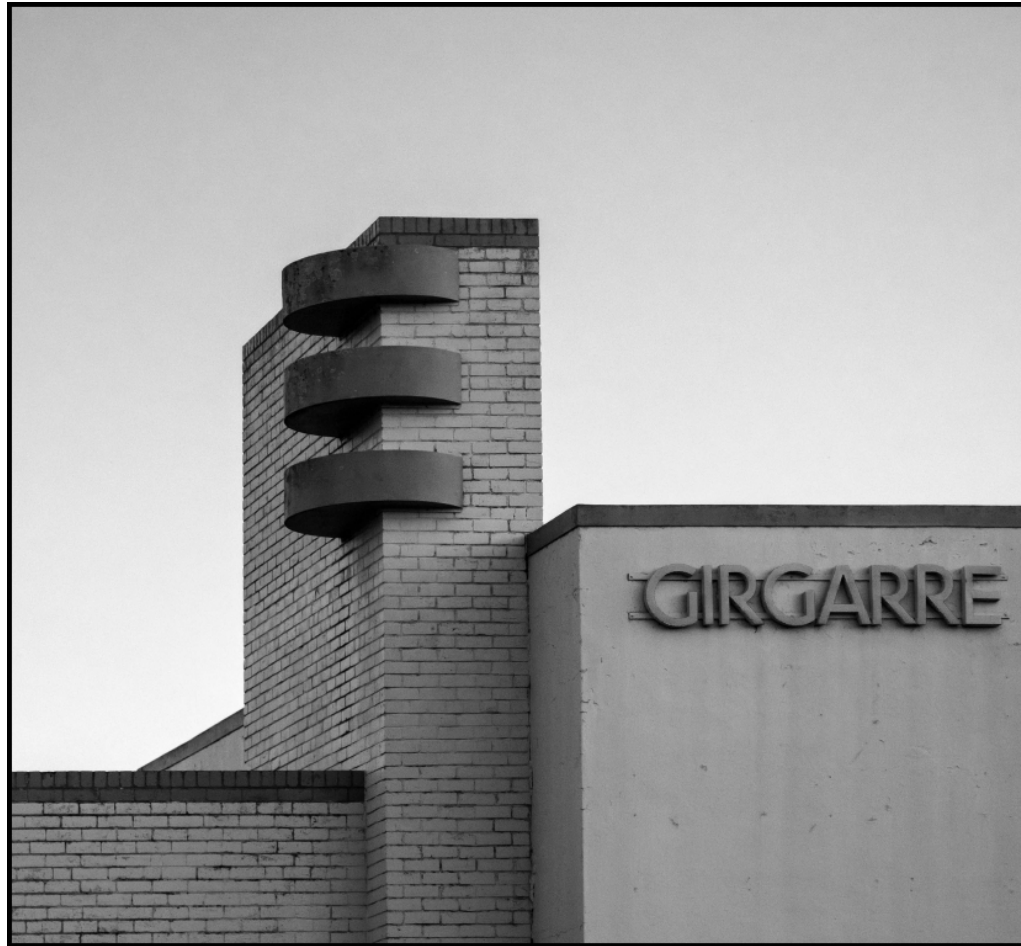
Factory Architecture Detail