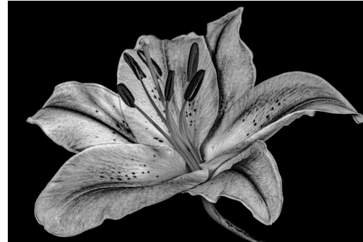
Perfection Accepted Patsy Cleverly