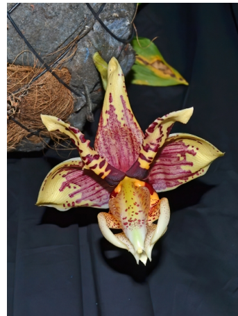
Special Orchid Accepted Robin Elliot