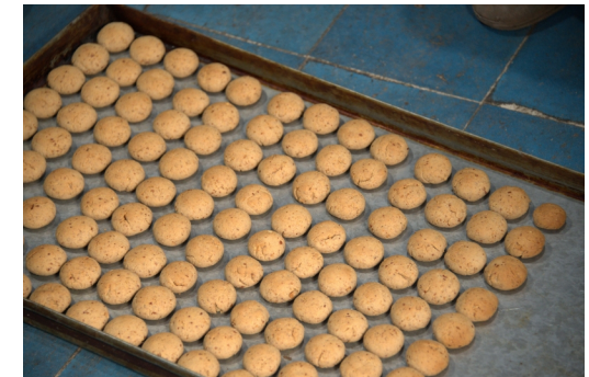
Hot from the Oven Accepted Leanne Wheaton