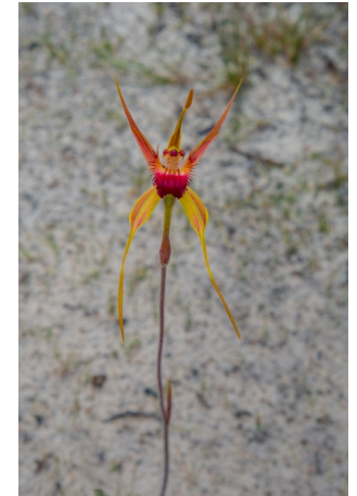
Spider Beauty Accepted Wendy Slater