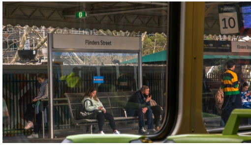
Meanwhile on Platform 10 Accepted David Skinner