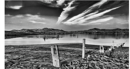
low tide Accepted Geoff Bayes