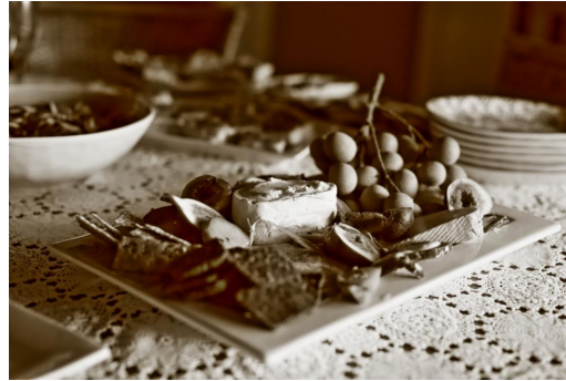
Grazing Accepted Bill Thompson