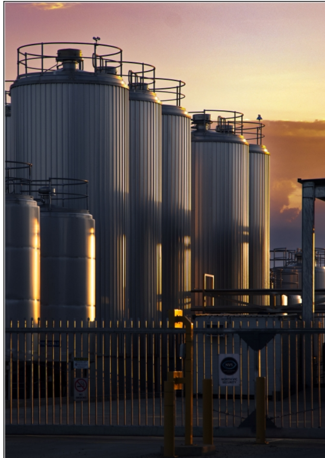
Dairy Factory at Dawn