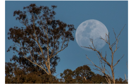
Moonrise over Myrhee Accepted Bill Thompson