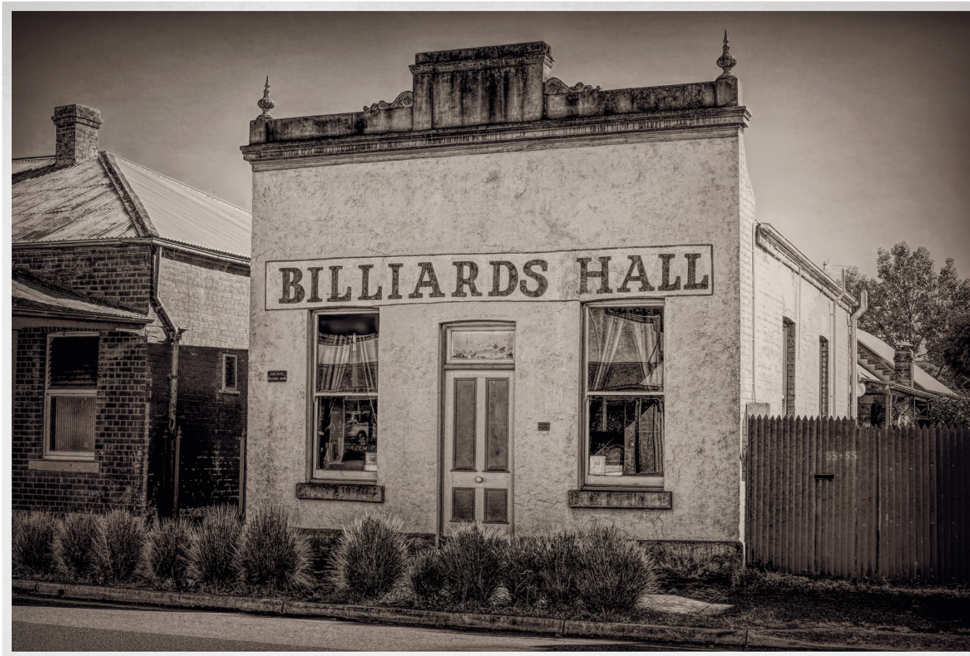
Past Times Second Place Vicki Cain