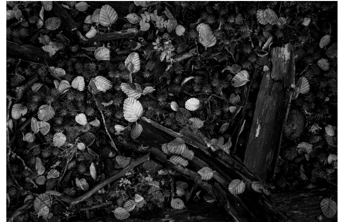
Littered Merit Wendy Slater