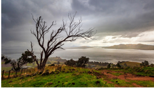
stormy weather Accepted Geoff Bayes