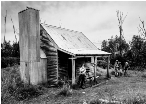
Old Meets New Accepted Allen Skilton