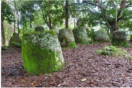
Plain of Jars Accepted Garry Pearce