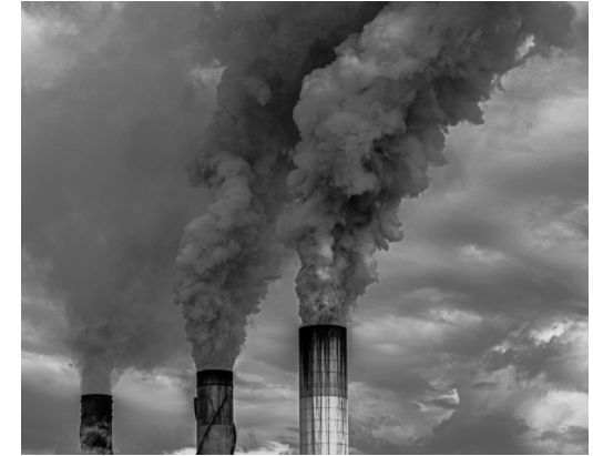
Sugar Load - Innisfail Sugar Mill Accepted Pauline Todd