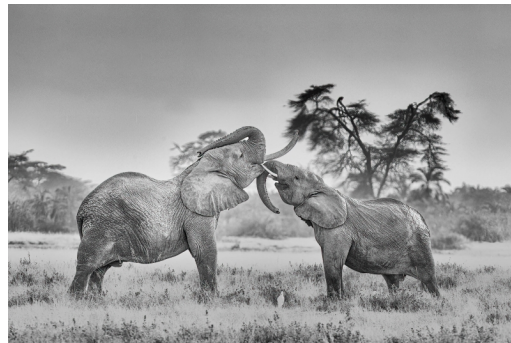
Elephants greeting Accepted Malcolm Godde