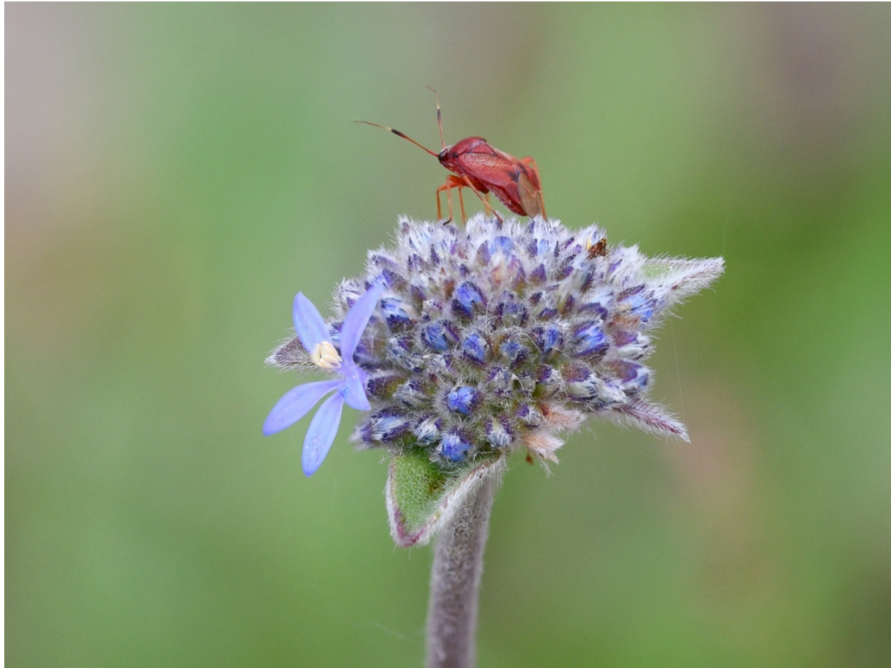
Native Blue Pincushion and Friend