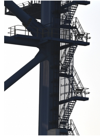
At the Wharf Accepted Leanne Wheaton