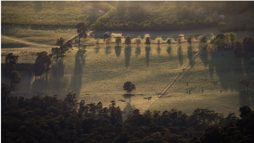
Morning Shadows Merit Yvonne Schnelle