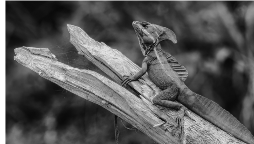
Basiliscus Basiliscus Accepted