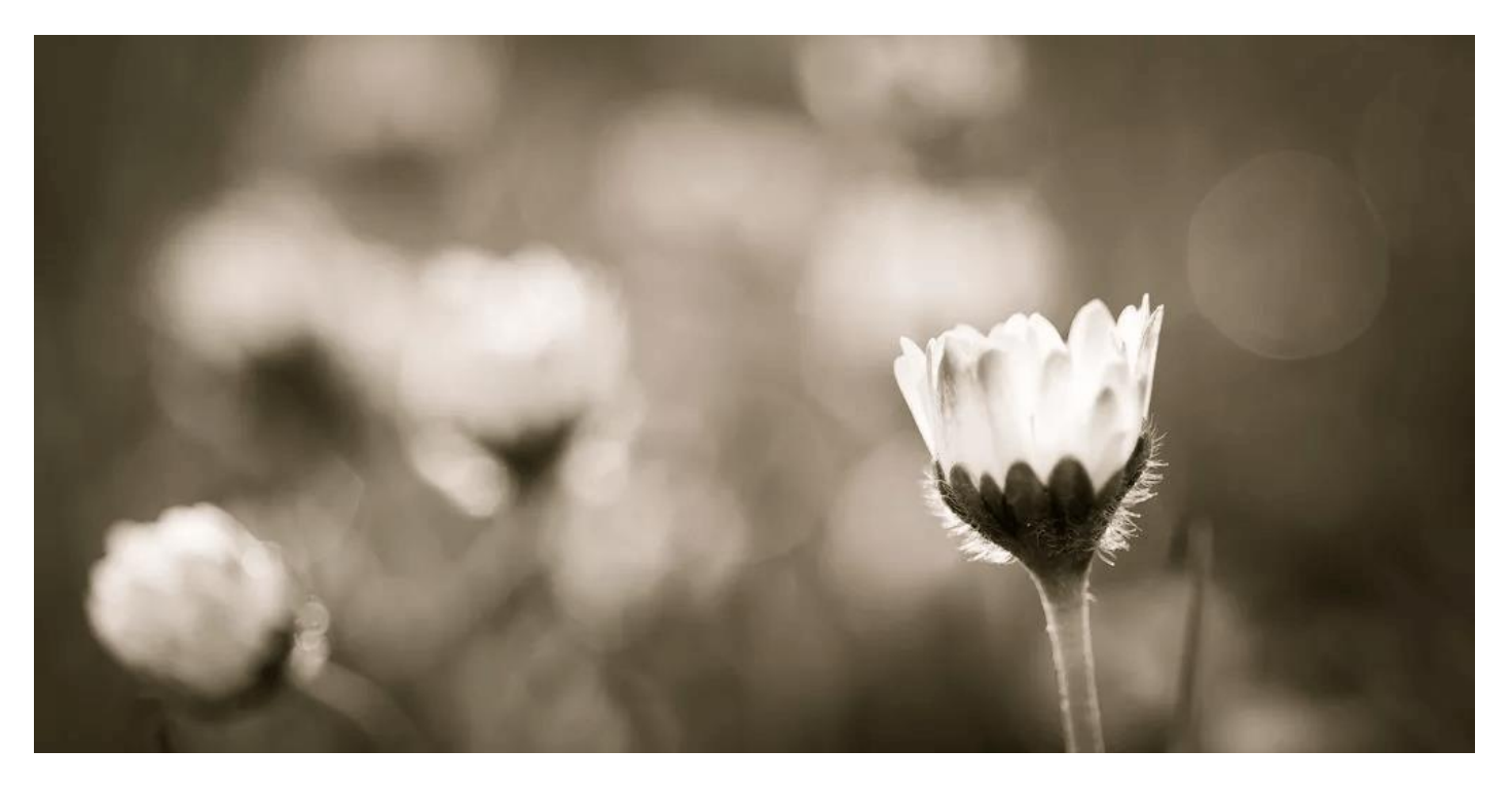
Best black & white photography vs monochromatic

Monochrome means variances of the same color. Take this image below, for example. At first glance, it might seem black and white. But if you look closely the image is filled with monochromatic variances of the color brown.