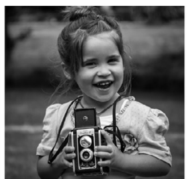
Page submitted by Comp Sec. Brian Paatsch