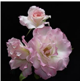
Above image: EDI Colour 'Seduction Rose' by Win van Oosterwijck