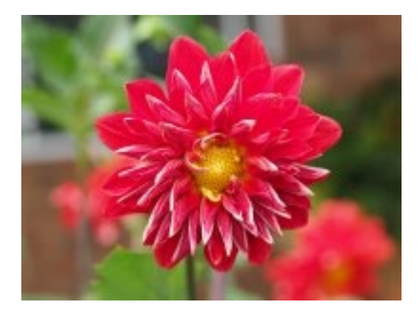
Images provided by Sharon Alston taken with Olympus OMD EMI MarkII 60mm Macro lens 1:2.8