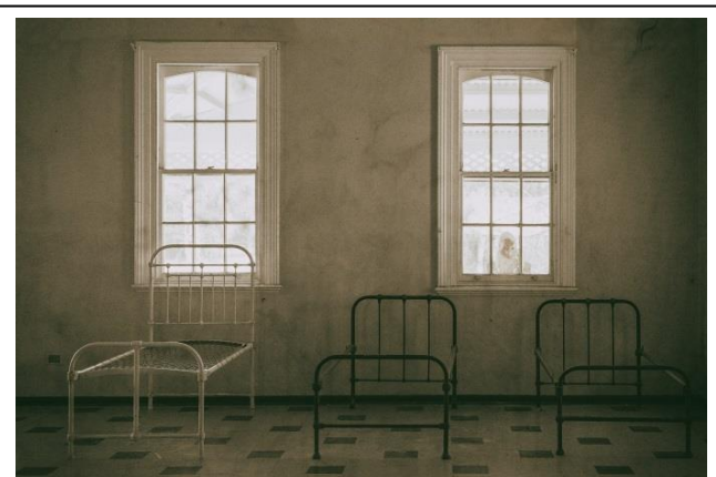
Wendy Stanford Reminder of Days Past