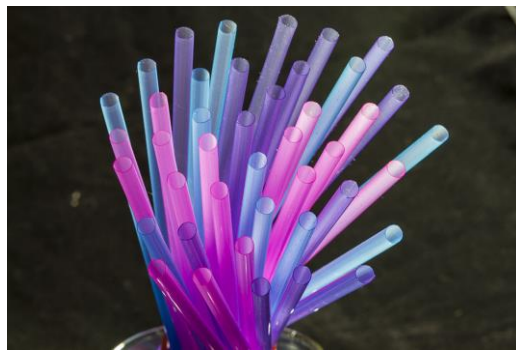
Wendy Stanford's "Sucking up Light "- before