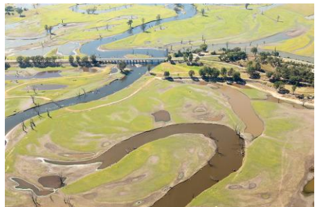
Tallangatta Valley (Garry Pearce)