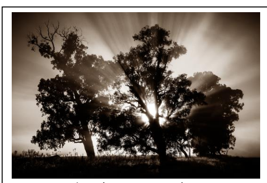
Morning Glory (Garry Pearce)

1. Have my camera with me at all times. Photographic opportunities occur all the time, not just when we're in photography mode. Morning Glory is one of those rare occasions where I've had my camera with me going about my daily routines: I was travelling to work and happened to notice this image in my car' rear view mirror. However, too often my camera is at home; too many times a good shot goes begging.