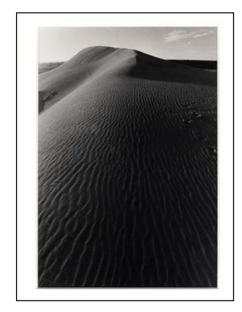
Lake Mungo Paul Temple

Please contact the editor if you have items for sale or would like to advertise for that elusive accessory