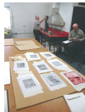
Waiting For Printing