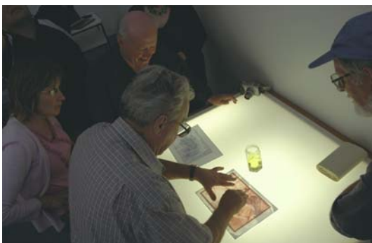
The Gum Bichromate Workshop